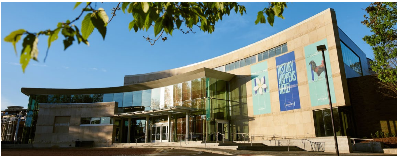
Opposite Page Top: Archetype Studio Inc. Bottom: Unknown Cover: Anne Rhett Photography