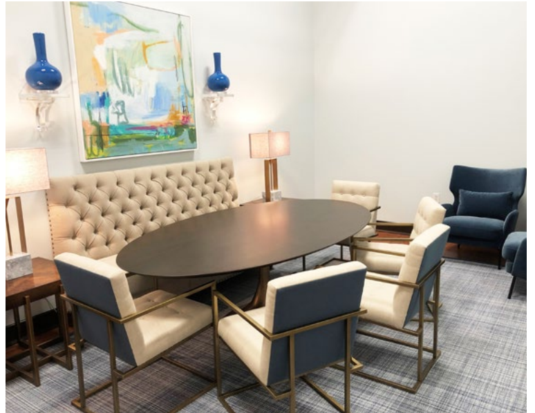
Opposite Page Steven Dickson