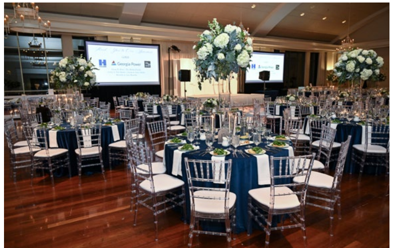
Opposite Page Top: Unknown