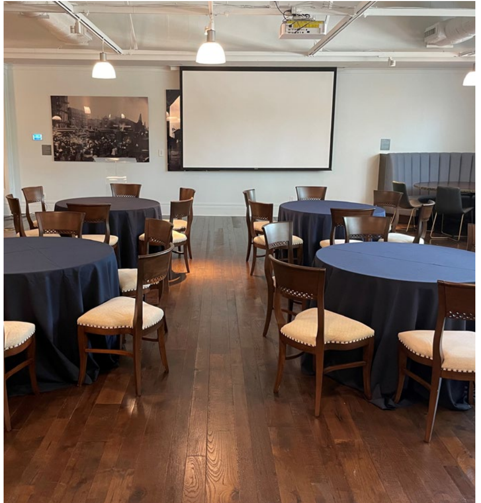
Opposite Page Top: Unknown