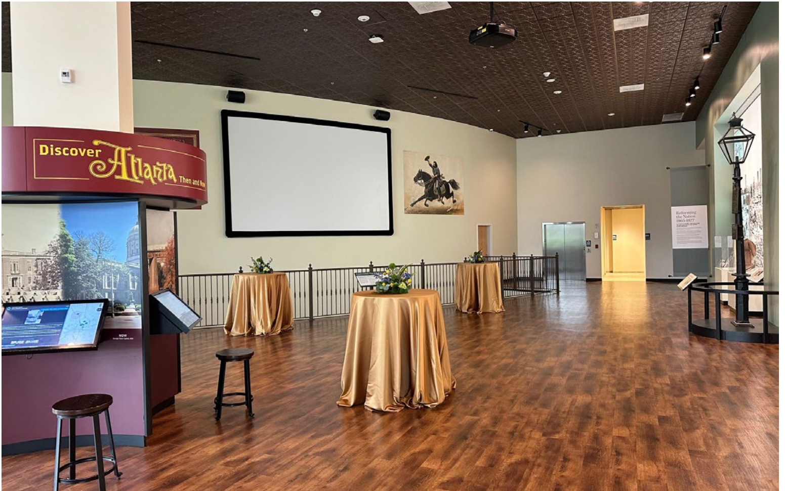
Opposite Page Top: Unknown