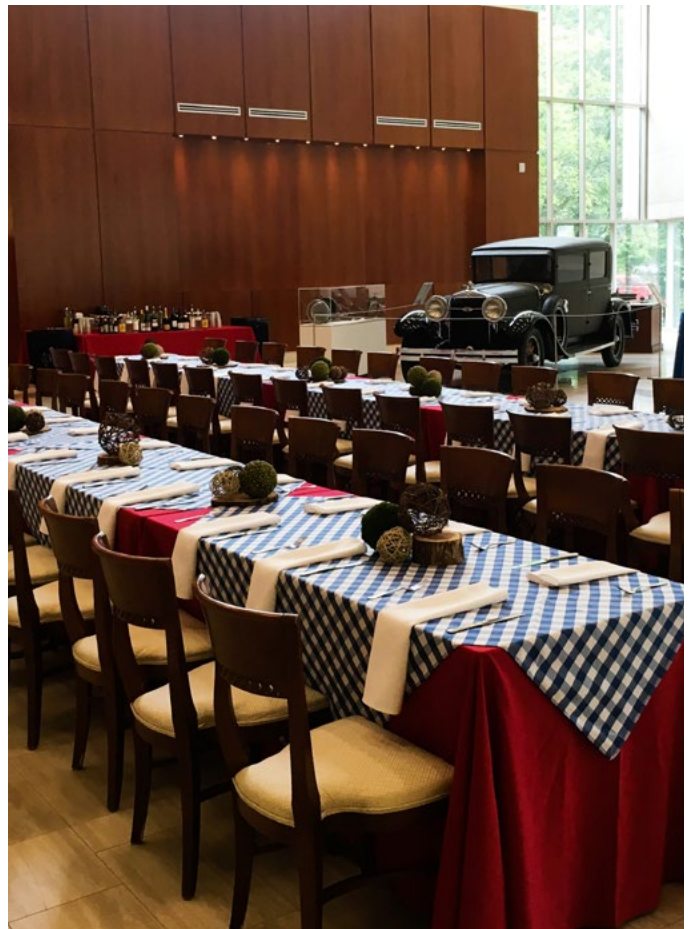
Opposite Page Top: Hales Photography