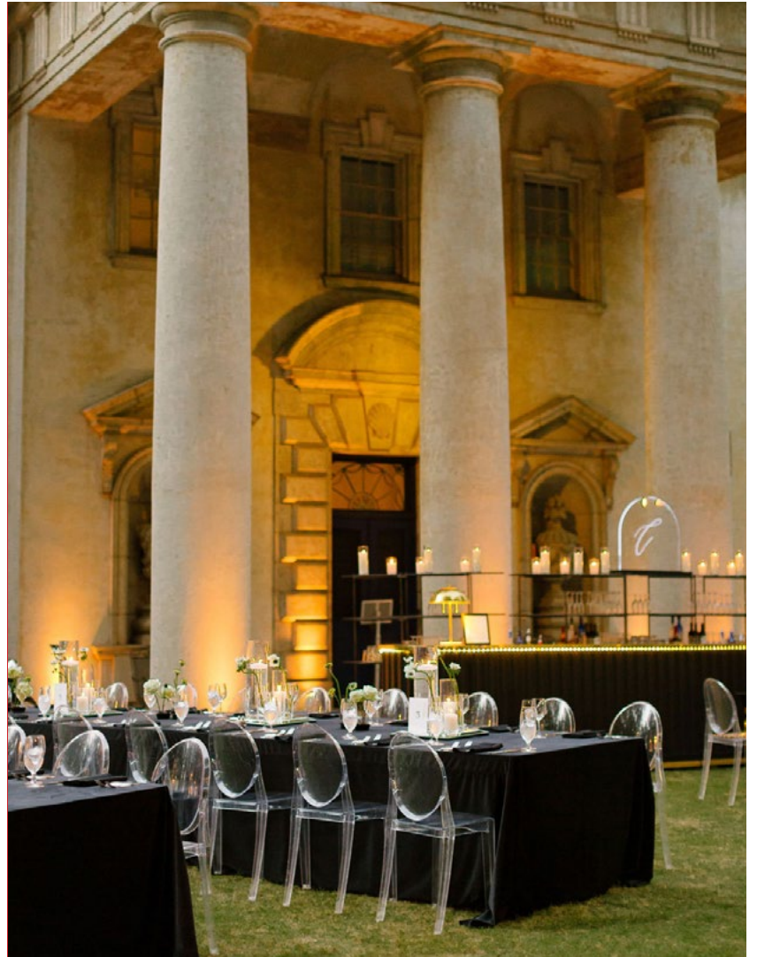
Opposite Page Unknown