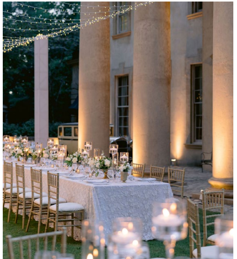
This Page Top: McSween Photography