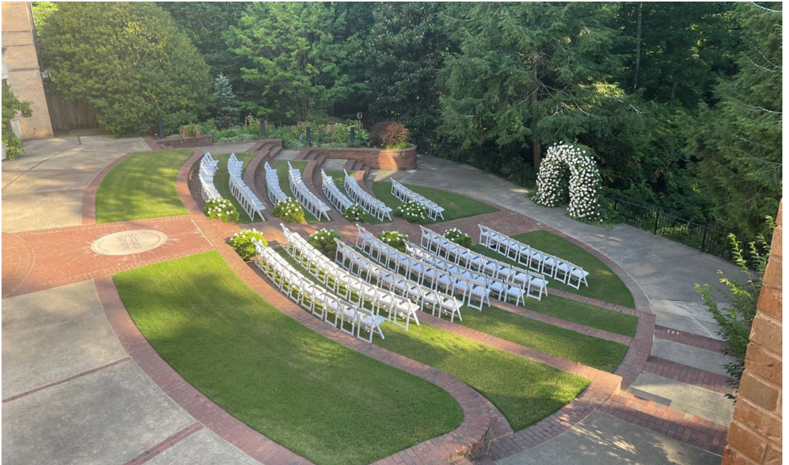
Opposite Page Ashley Cathy Photo