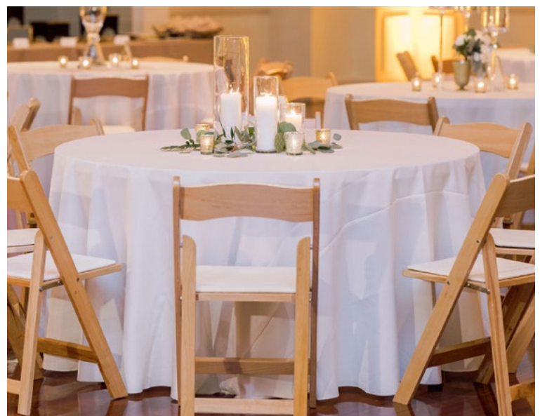
Opposite Page Top: Mel Toms