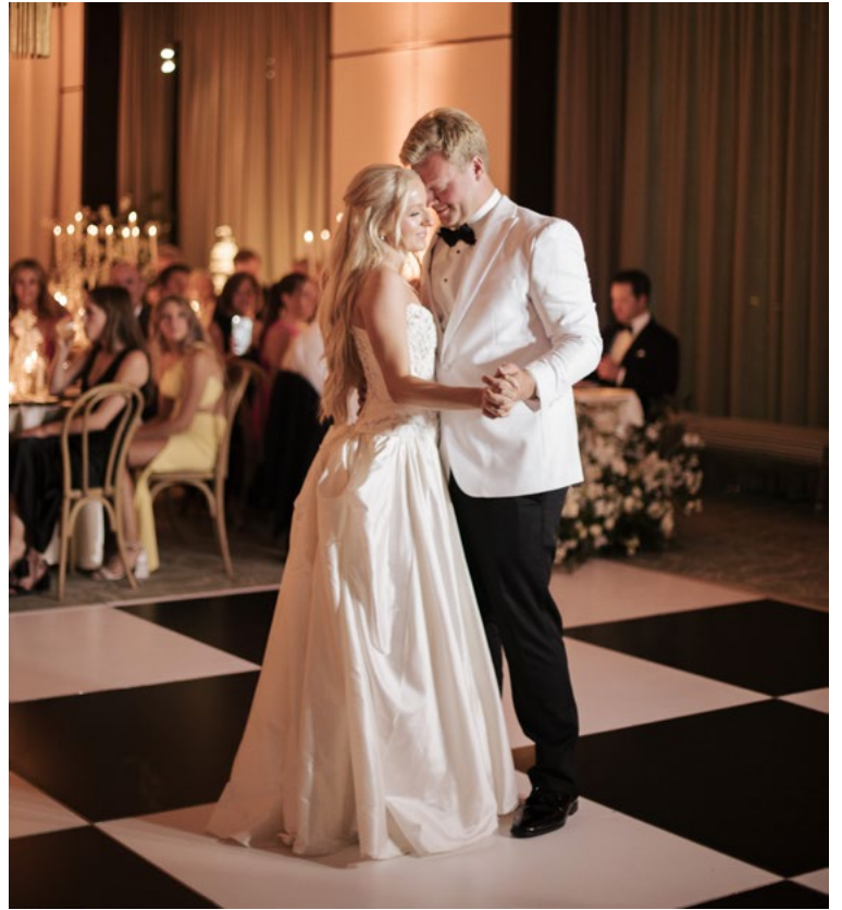
This Page